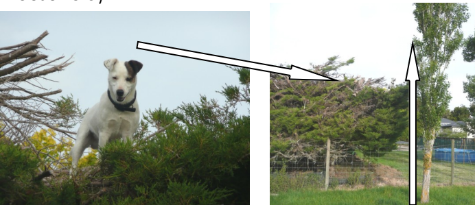
Up the top of the tree

His claim to fame in the last six months has to become a possum hunter extraordinaire. Unfortunately we usually find out about his finds by his incessant barking at 2 o'clock in the morning indicating that he has a possum bailed up in a tree and is waiting for someone (not me) to deal to it. He has found the odd one during the day by climbing the Macrocarpa trees (a skill honed by retrieving a ball placed in a tree out of reach by the men of the household)