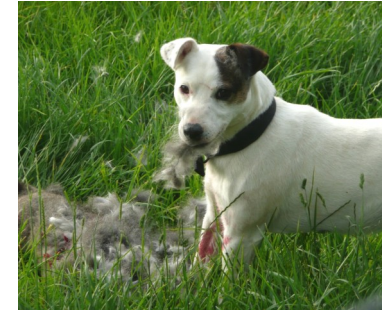
The chase is on