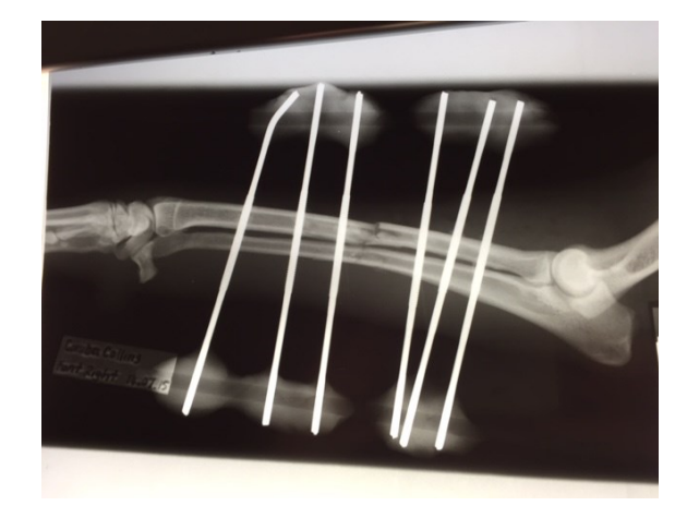
Post operative x-ray.