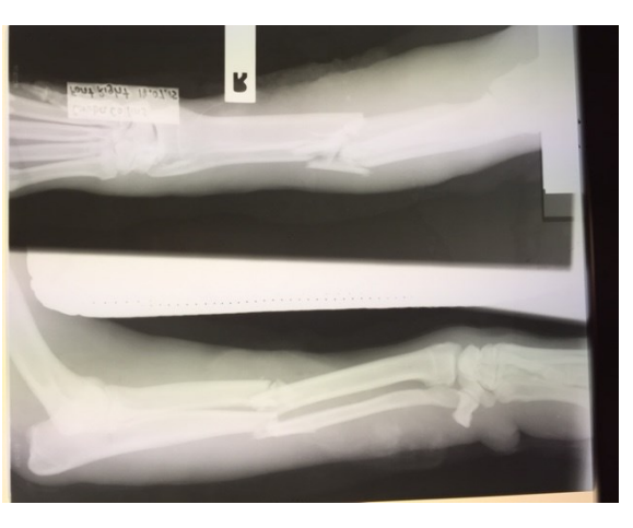
Coruba's leg after the accident. You can see it is severely broken.